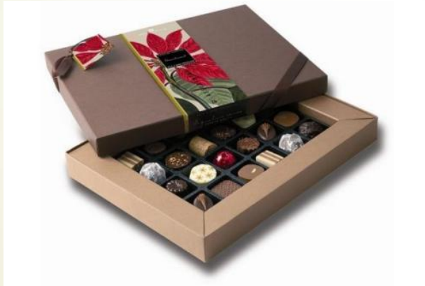
A box of chocolates