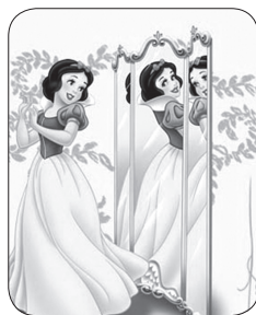
C. Snow White

16. Which of the following sentences does NOT share a similar meaning to the others?