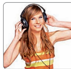
Listening to English songs