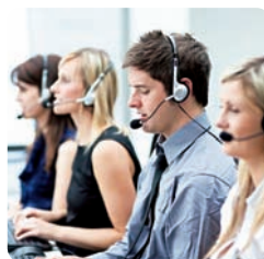
Doing listening practice tests