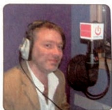
Listening to English radio programmes

B. Many students find it difficult to improve their English listening skills. Do you have any good advice? Would you recommend the following activities?