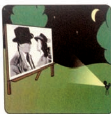
Watching English films