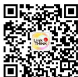
外研社高等英语资讯