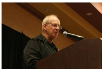
Stephen D. Krashen

Stephen D. Krashen has published over 500 articles and a dozen scholarly books in the fields of literacy, language acquisition, neurolinguistics, and bilingual education. Many of these publications are available for free download at sdkrashen.com . He no longer writes books. Nevertheless, he is the most frequently cited scholar in the field of language education.